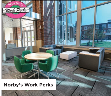
Norby's Work Perks