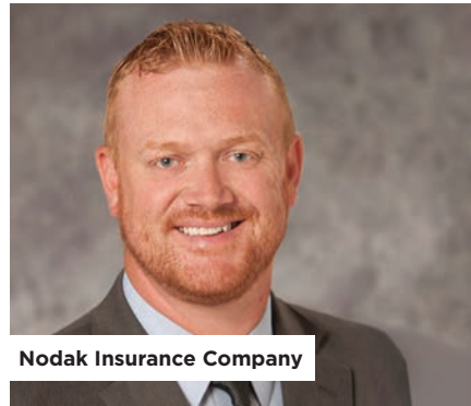
Nodak Insurance Company