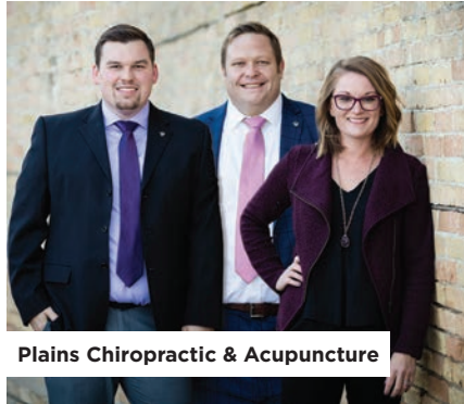
Plains Chiropractic & Acupuncture